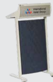
All great leaders stand behind a Lectrum