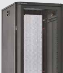
Server racks & cabinets, SCEC approved racks & storage