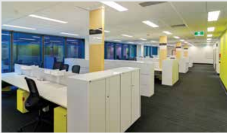
Office storage furniture solutions & commercial storage. SCEC approved storage.