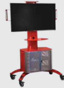
Technology storage, mobile stands for large screens, AV mounts.