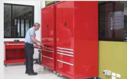
Industrial storage solutions